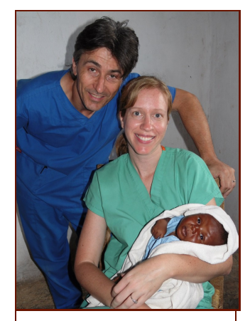
3 month old successfully treated for fungal pneumonia

they had labored breathing and their lung sounds were very "wet", but hospitalization was not an option...we tried. So Liz and I titrated our own liquid formula of fluconazole with water and sugar so that the babies would take it with a syringe. One mother walked 6 hours two days in a row for her baby's treatment.