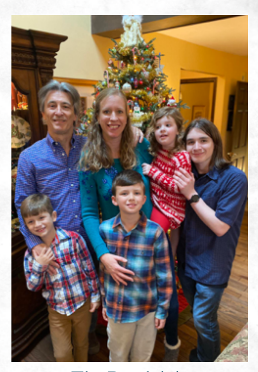
The Randolph Family continues to do well.