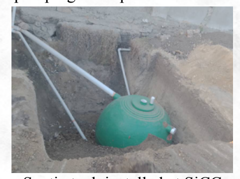
Septic tank installed at SiCC

Much has been said about the SiCC in the previous sections of this newsletter, but this section will summarize progress and future plans. As mentioned earlier, the SiCC structure is about 90% complete. Although the septic tank was installed by a Haitian contractor this winter, the leach field still needs installed. Installing the leach field is not an emergency, just a way to disperse gray water to reduce the time between pumping the septic tank.